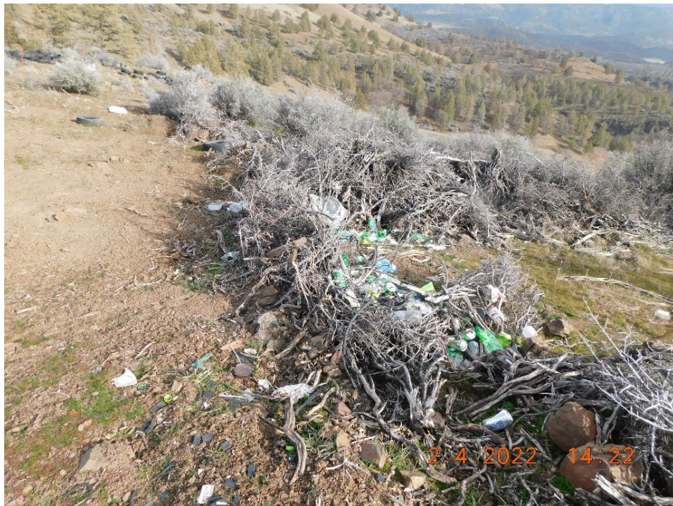
Figure 3: Facing West on the hillside