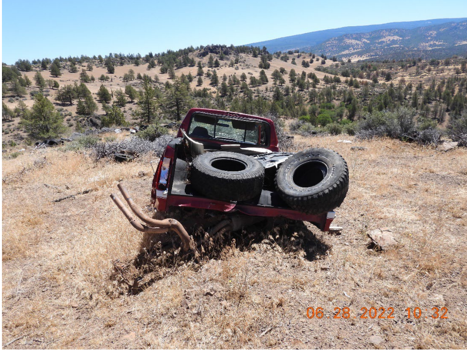
Figure 4 Facing East