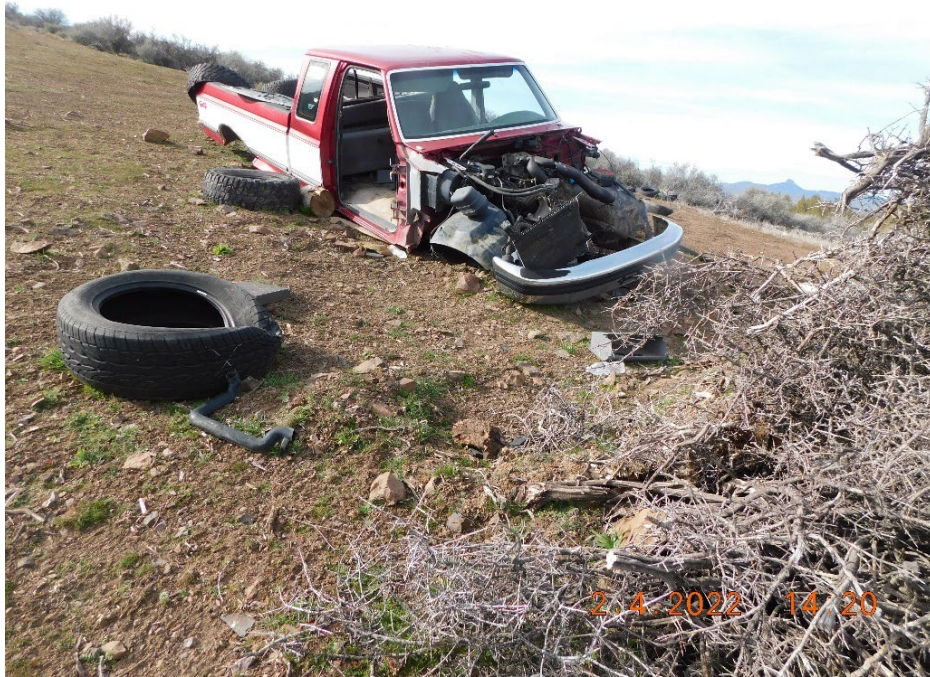
Figure 2: Facing West