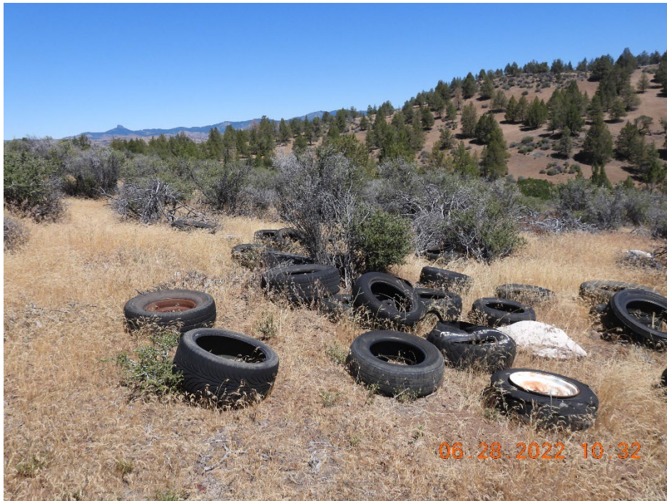
Figure 5: Facing Northeast